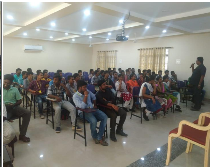
Faculty members and students during the session